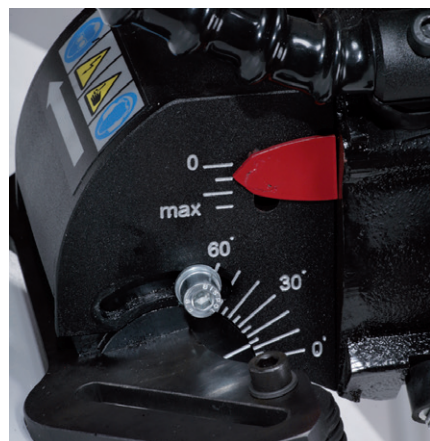
Continuous angle adjustment from 0 to 60 degrees.