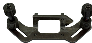
Optional guide for pipes Ø 260-600mm (10-24") Product code: PRW-0461-22-00-00-0