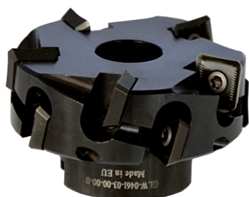
Mono block milling head, with 10 indexable inserts fixed with screws. Product code: GLW-0461-03-00-00-0

Standard universal guide plate for beveling both plates and pipes Ø 150-300mm (6-12")