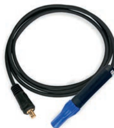
71.24.001 Stick electrode holder