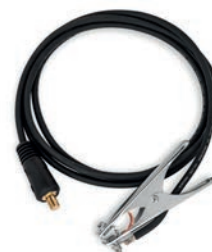
71.25.001 Work cable